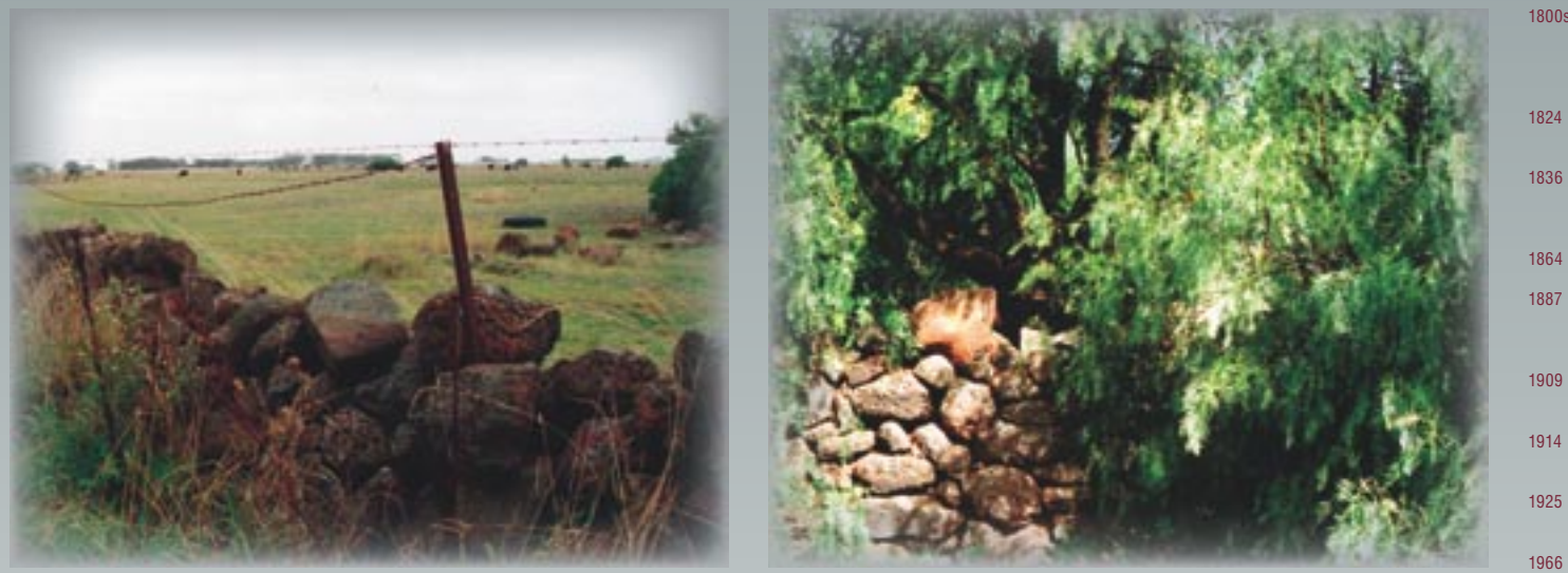
Stone walls are found throughout the North West of the City of Wyndham. Notable examples can be seen on Edgars Rd, Boundary Rd, Ballan Rd and Doughertys Rd.

Wyndham is entirely within the Western Plains, which stretch west from Melbourne. Most of the plains are of recent volcanic origin, formed just 2.5 to 5 million years ago, by lava flows bursting from fissures and low lava cones. Green Hill, in the northwest, and Cowie's Hill, along Tarneit Road, are the most prominent lava cones.