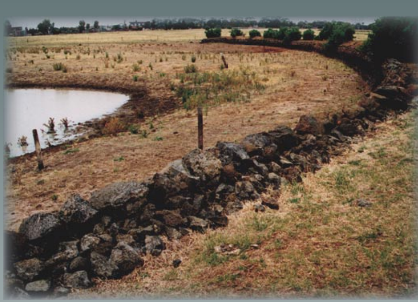
Large dam with extensive stone retaining wall attributed to W.J.T. Clarke one of the early pastoralists in the State of Victoria. By early 1837 the Werribee plains were fully stocked with sheep to a distance of forty kilometres inland from the coast of Port Phillip Bay.